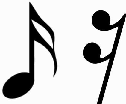
16 th Note and 16 th Rest \frac{1}{4} of a beat