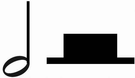
Half Note and Half Rest 2 beats